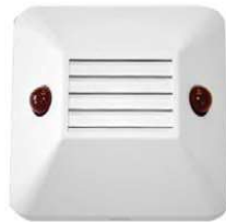
Audio - Optical Signaling Device